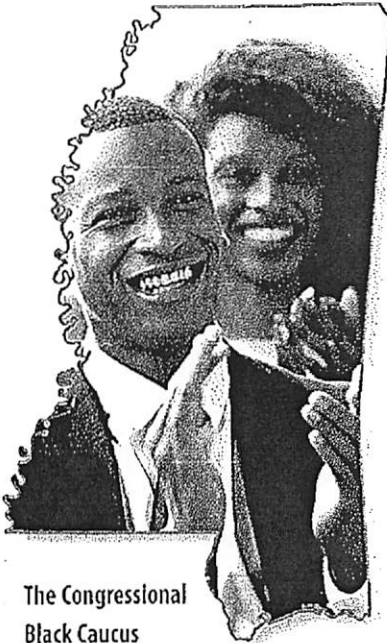
The Congressional Black Caucus

Institute champions and plans seminars based on these issues: